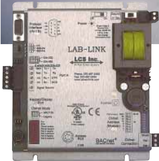
Lab~Link® protocol translator